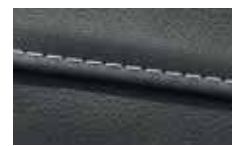
LIGHT GREY 0321

The below displayed combinations of seam colour and leather colour are recommended, exemplary assignments of the 6 available colours of contrast stitching.