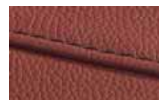
DARK BROWN 1002